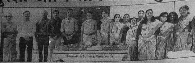
कार्यक्रमात उपस्थित मान्यवर

● पवतमाळ २५ ऑक्टोबर पंजीत लोकनाटक शास्त्री अणे महिला महाविद्यालयाच्या अध्यक्षणी आणि शारीरिक शिक्षण विभागामार्फत एक दिवसीय महिलांकर प्रतिष्ठा सुरक्षा आणि सायबर सेक्युरिटी कार्यशाळा घेण्यात आली